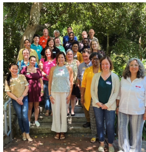
GCC staff at the staff retreat in July 2024

New subrecipients or others who would like to join are also welcome. Be on the lookout for an additional announcement for how to register.