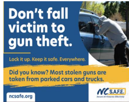
NC S.A.F.E. signage at Gun Firing Ranges