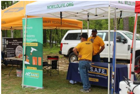
NC S.A.F.E. at the 202 Hunter Skills Education Tournament