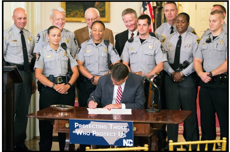
Governor McCrory signing House Bill 1044 (Law Enforcement Omnibus Bill) and House 972 (Law Enforcement Recordings/No Public Record).

The North Carolina General Assembly opened its 2016 legislative short session on April 25th, to make adjustments to the state's biennium budget and to address bills that were left over from the 2015 long session. The session took only 68 legislative days, during which 112 bills and 21 resolutions were passed, including the budget bill, House Bill 1030, before adjourning on July 1st.