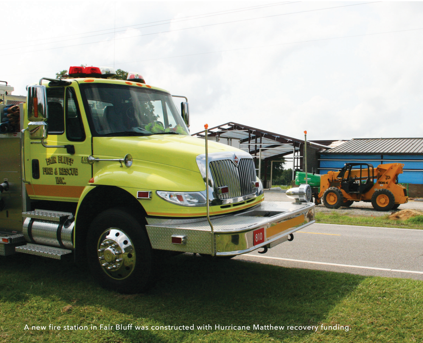
A new fire station in Fair Bluff was constructed with Hurricane Matthew recovery funding.