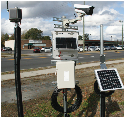
Low-cost flood gauges being tested in Lumberton.

Thirty-two new flood gauges purchased with state and county funds were added to the state's Flood