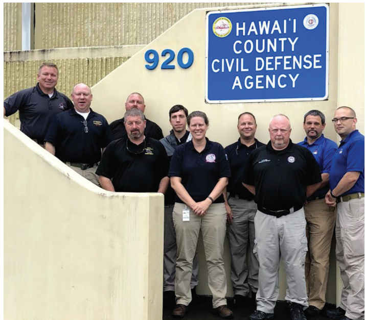
Ten local and state emergency managers comprised this incident management team, the first of three that served in Hawaii this year.