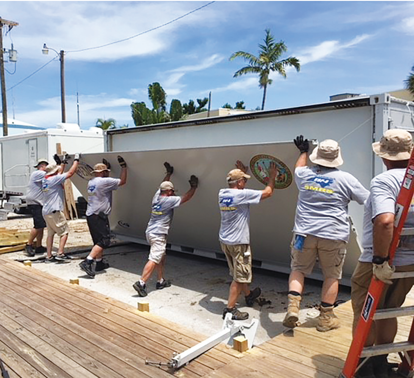
Team members from NC Office of Emergency Medical Services pack up elements of the mobile emergency department before its return home from the Florida Keys.