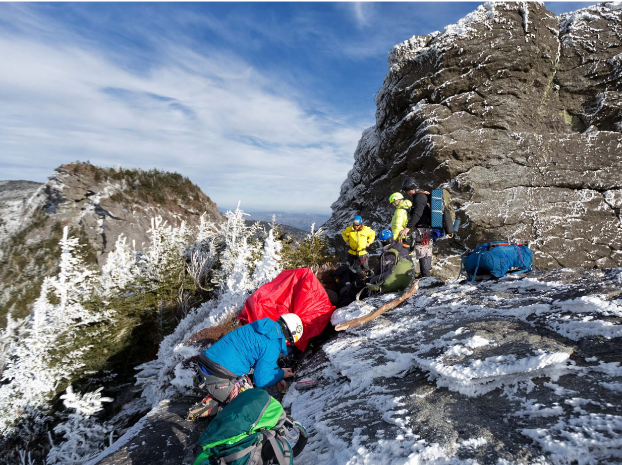
Mountain search and rescue teams conduct winter training in western North Carolina mountains.

NCEM administers state and federal grants, manages multi-agency disaster responses, oversees all hazards and threat risk management, coordinates regional hazard mitigation plans, facilitates trainings and exercises and manages assets such as the regional hazardous materials response teams and search and rescue teams. In addition, the agency develops and maintains